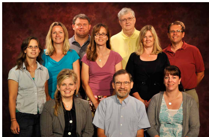
Life Spring Network Staff Illinois

These churches used to be the spiritual and relational anchors of their communities and are now barely hanging on. We have begun the LUKE Ministries Chicago project to reverse this trend and serve as a model of urban renewal. We will begin working with five congregations over the next five years and expand into more congregations as God leads. In order to fulfill this mission, we have already begun to expand our staff here at LSN.